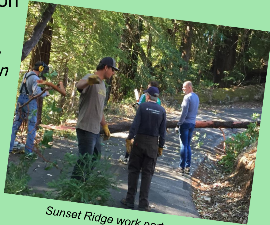
Sunset Ridge work party